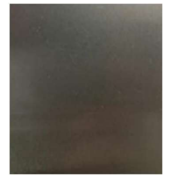
No change after 100 cycles