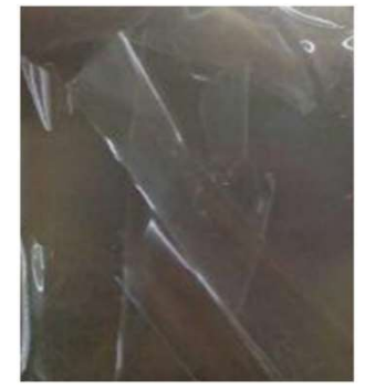
Film broken after 5 cycles